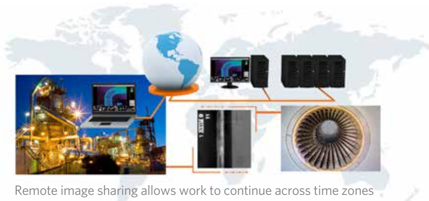
Remote image sharing allows work to continue across time zones or to be sent to off-site experts for simultaneous evaluation